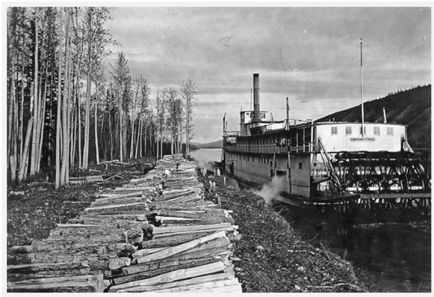
Photo Source: National Park Service, Klondike Gold Rush National Historical Park, Candy Waugaman Collection, KLGO Library TS-202-8868.

www.nps.gov/klgo/learn/historyculture/environmental-impacts.htm