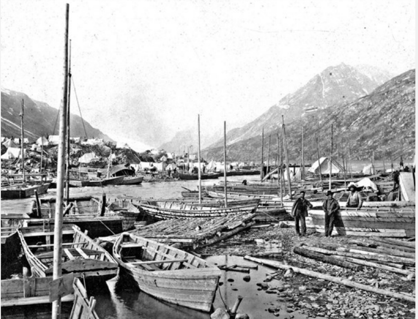
Photo Source: National Park Service, Klondike Gold Rush National Historical Park, George and Edna Rapuzzi Collection, KLGO 55690. Gift of the Rasmuson Foundation.

www.nps.gov/klgo/learn/historyculture/environmental-impacts.htm