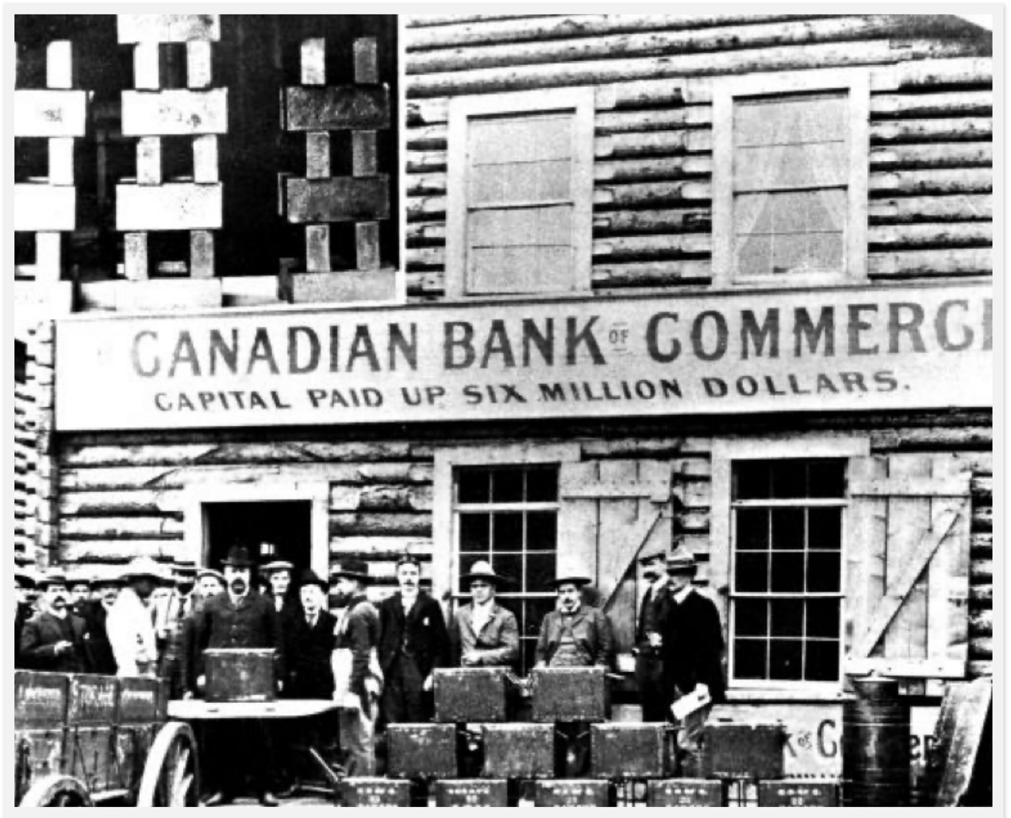
Photo Source: Goetzman, H.J. Shipment of $1,000,000 in Gold for the U.S. Mint. 1899. Yukon Archives.

http://yukon.minisisinc.com/scripts/mwimain.dll/144/FIL/LIST/SISN%2014112?SESSIONSEARCH